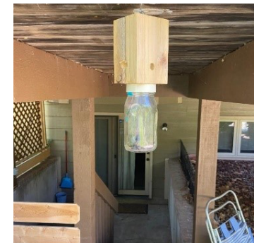
Carpenter Bee Trap