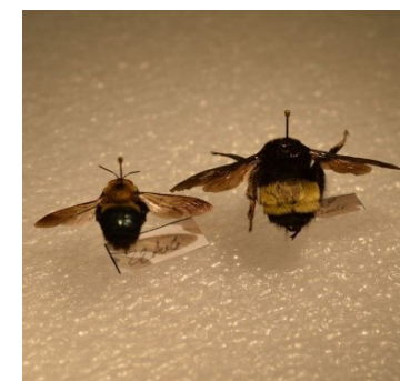
left: Carpenter Bee right: Bumble Bee