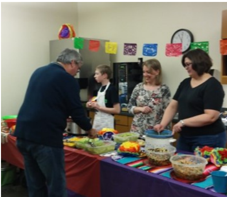
The movie The Three Amigos was represented by the Stanley Buccaneers 4-H Club.

Johnson County 4-H celebrated the movies and food at the Annual Food Fare held at the extension office on March 5. Members and leaders from Blue River Wranglers, Country Hearts, Frontier Family, Great Plains, Lucky Clover, Morning Glory, Oxford Hustlers, Pioneer, Prairie Star, Sharon, Stanley Buccaneers, and the Johnson County Master Food Volunteers each chose a movie and provided samples of food that represented that movie. Approximately 100 4-H members, parents, and guests attended the event. Thank you to all who participated in and/or attended the food fare. We look forward to seeing you next year!