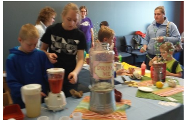
The Prairie Star 4-H Club chose Alice in Wonderland for their movie.