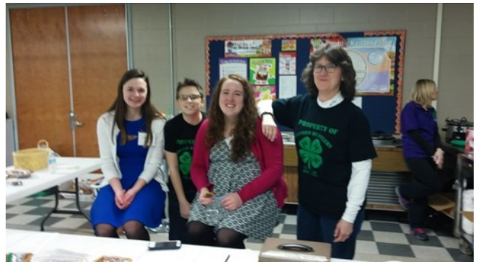
Johnson County 4-H Ambassadors provided the concessions for the event. Proceeds from the concession stand are used to promote 4-H and provide various scholarships for events.