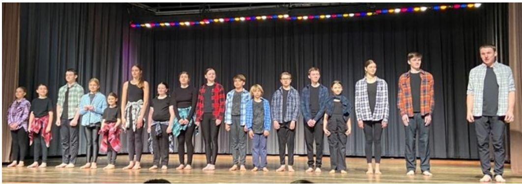
Club Dance: Muddy Water