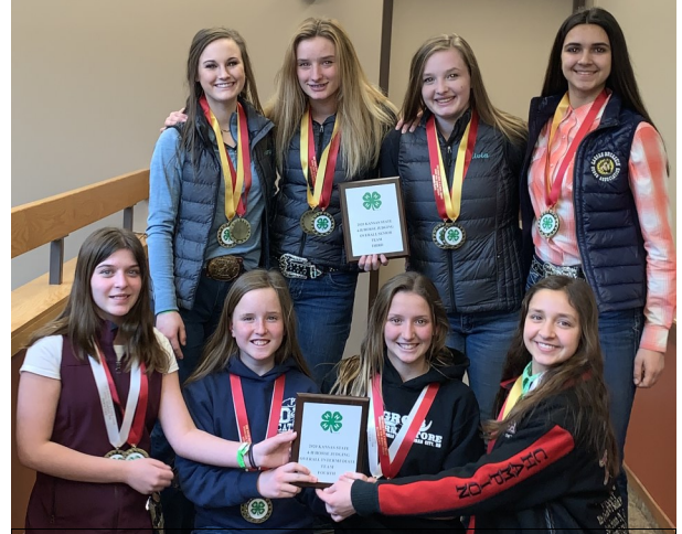
Senior and Intermediate teams at the February 2020 Kansas State Horse Judging Contest in Salina.

In conclusion, I am very proud to lead this great group of young horsemen. Jo. Co. 4-H Horse Club has taken a financial hit for the year of 2019/2020. However, plans for a strong 2020/2021 are already under way.