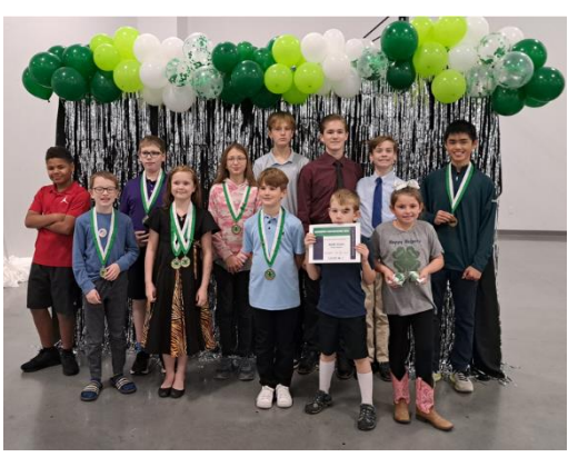
Happy Helpers 4-H Club at County 4-H Achievement Celebration

The County 4-H Achievement Celebration was held on Saturday, November 2, 2024. The Happy Helpers 4-H club received a purple seal for their involvement during the 2023-2024 4-H year. Sixteen club members received recognition for completing their yearly