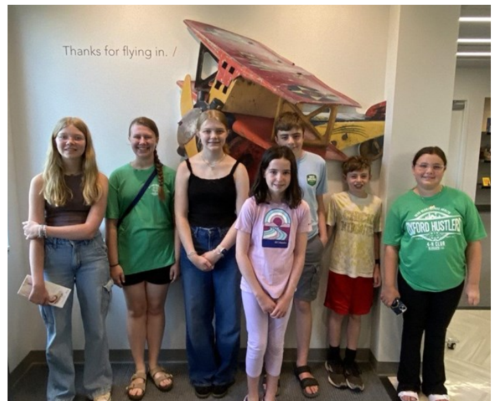
Members of the Oxford Hustlers 4-H Club participate in the annual Educational Tour.

On July 13, 2024, the Oxford Hustlers had their yearly education tour at the Toy and Miniatures museum in Kansas City. The annual educational tour offers an opportunity for our club to learn more about something interesting in our community. It was so much fun to learn about how miniatures are made and to see all the cool rooms that miniature artists have constructed. It was also super fun to see different children's toys from different decades, such as different doll houses or teddy bears! The Oxford Hustlers had so much fun at the Toys and Miniatures museum, and we notice many connections to 4-H projects like visual arts, fiber arts, sewing and textiles, woodworking, and STEM.