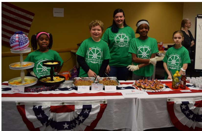
Members of Frontier Family 4-H greet guests at the Johnson County Food Fare.