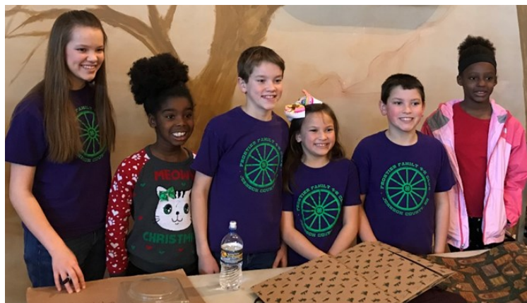
Club members pause from their Christmas gift wrapping fund raiser.

On January 4, the Frontier Family 4-H Club wrapped gifts at a local retail store and raised money for the club. The club has been doing this for 2 years and members have lots of fun helping families get ready for Christmas. The club decided to wrap gifts for free and have a tip jar for people who wanted to give money to the club. The club also had a Christmas party. They had a big feast and played lots of games like unwrap the gift and a fun plastic wrap game. They also decorated paper placemats for nursing homes residents.