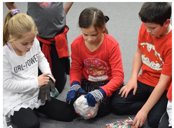
Frontier Family 4-H'ers work together unwrapping a gift to the club.