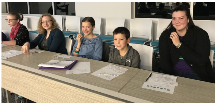
4-H club members taste test sour candies.

On October 11th, the Frontier Family 4-H Club and guests met at Corbion, a food science company in Lenexa, Kansas. Corbion employees gave a food science talk and sustainability talk. 4-Hers and guests did a taste test on sour candies to show how the company tests its flavors. The normal club meeting was held in the Corbion cafeteria. New club officers were installed. The meeting ended with a tour of Corbion's meat and bakery labs.