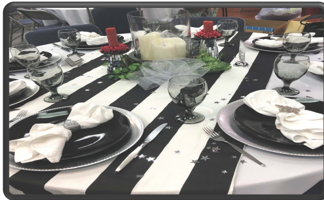
Table Designers Needed for 12 Tables

Volunteer designers will have the opportunity to display their creativity with color and design by providing décor for their individual tables. You may make this a team project or do this on your own. So use your imagination and get those creative juices going – this will be a great time for all! Table centerpieces will be auctioned off during the live auction. And, to add to the excitement – prizes for the top three decorated tables!