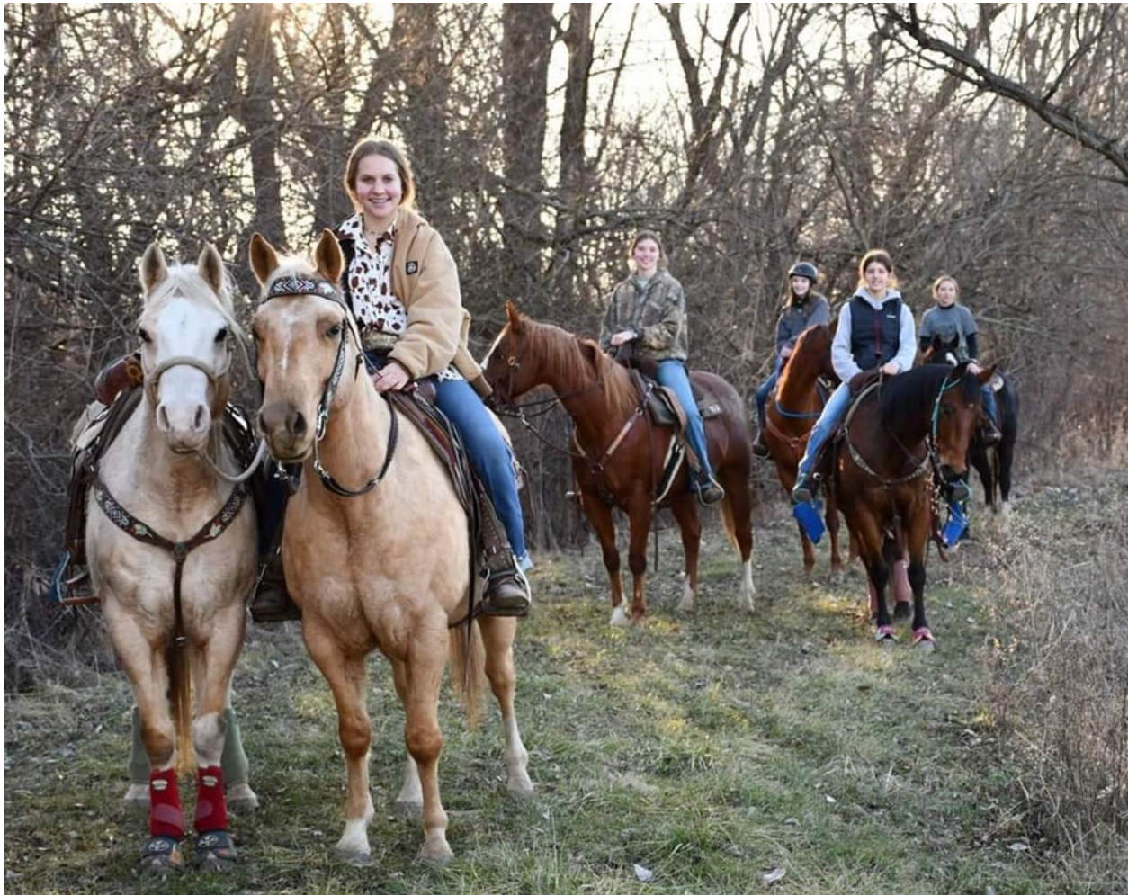
Johnson County Horse Club on a trail ride.

All of the clubs helped clean and set up the fairgrounds before and after the fair. Many club members also assisted the department superintendents during project judging.