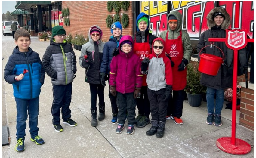
Happy Helpers 4-H Club bell ringing for the Salvation Army

Several clubs ring Salvation Army bells and help out at the Johnson County Christmas Bureau. Many clubs also complete projects for the churches or organizations where their club hold their monthly meetings.