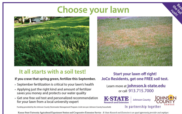
Water quality ad, JoCo Mag Summer 2018