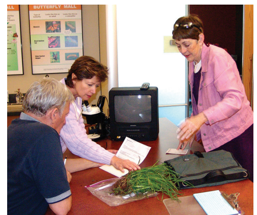
The Gardening Hotline is a free service.